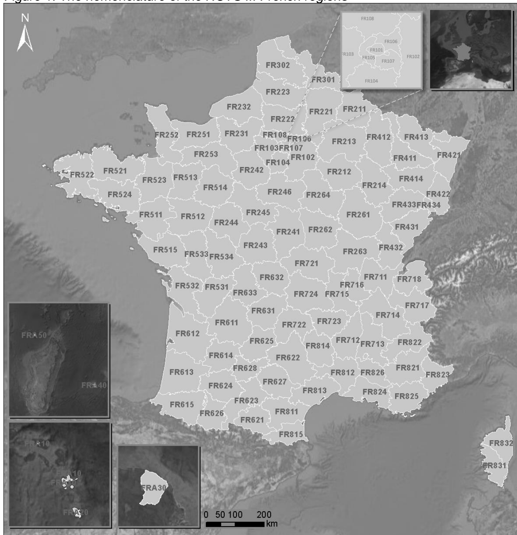
Figure 1: The nomenclature of the NUTS III French regions